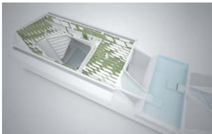
bird's eye view with the communal pool private pool of the suite